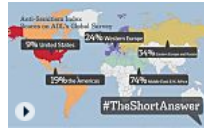
Anti-Semitism Index Measures Perceptions of Jews