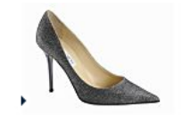
The Jimmy Choo Heel That Has Asia Panting