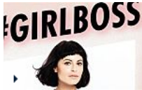
Nasty Gal CEO: From Dumpster Diving to $100 Million