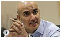
Opinion: How Bad Can California Get?